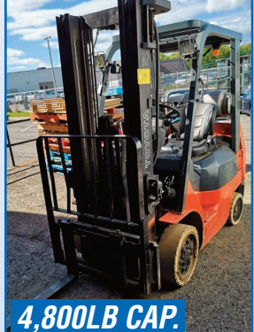
TOYOTA 7FGCU25 PROPANE FORKLIFT

Hoppers, Trays, Carts, Transformers, Pallet Racking, Welders, Digital Scales, Aluminum Baker's Carts/Trays, Power Tools, Tool Cabinets, Office Equipment & Much More!