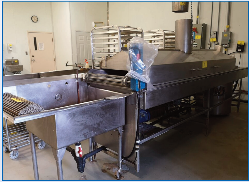
POSS DESIGN 0011-24 CONTINUOUS COOKER, 40KW, 220V W/ COOKING/MIXING KETTLE & COOLING HOPPER, INFEED CONVEYOR, CONTROLS, S/N 011