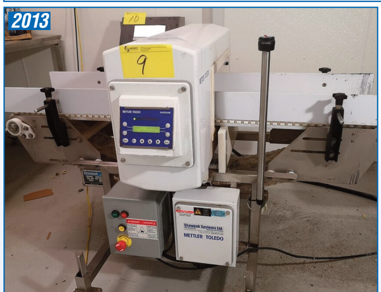
METTLER TOLEDO SAFELINE CON5460 FLOW-THROUGH METAL DETECTOR, 7" X 14" OPENING, S/N 119721

12a-261 Martindale Rd., St. Catharines, ON