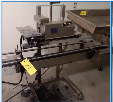
STEELTEK ST225/560/MKM HEAT SEALER W/ HITACHI PB-260U INKJET PRINTER