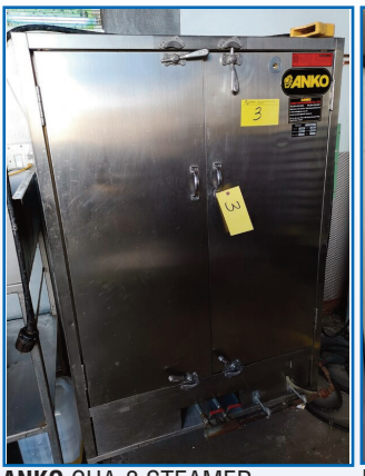
ANKO CHA-3 STEAMER