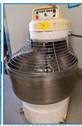
HARVEST CORP. TREEMME SPIRAL MIXER