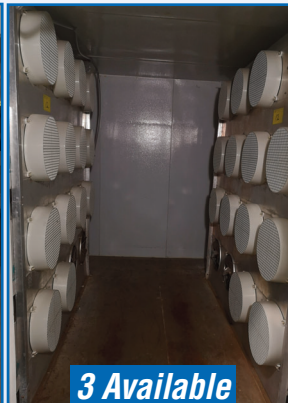
CURTIS WALK-IN FRIDGE/ FREEZER/BLAST FREEZER W/ KEEPRITE COOLING UNITS