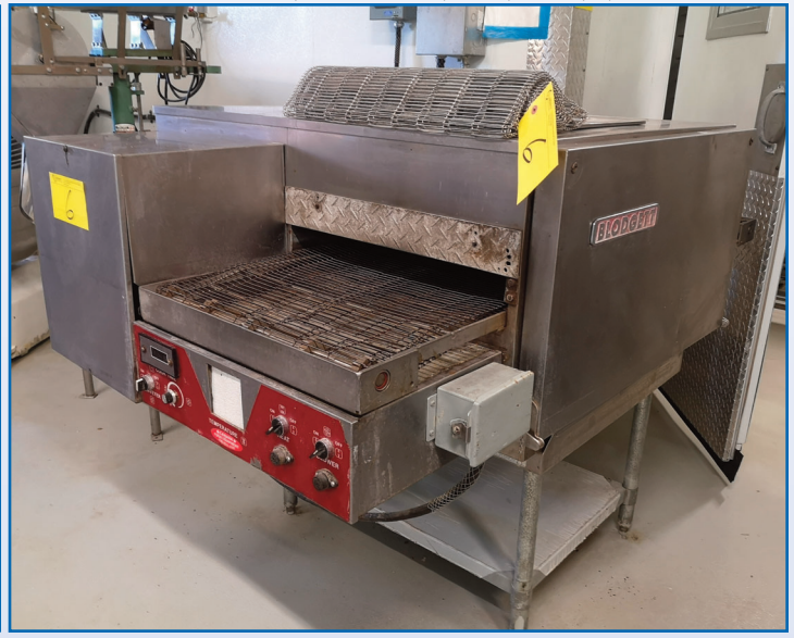
BLODGETT MT21-E DOUBLE STACK ELECTRIC CONVEYOR OVEN, 18" BELT, 28" TUNNEL, 120/240V, S/N 0792F0291101