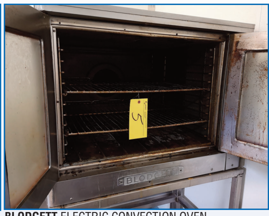
BLODGETT ELECTRIC CONVECTION OVEN