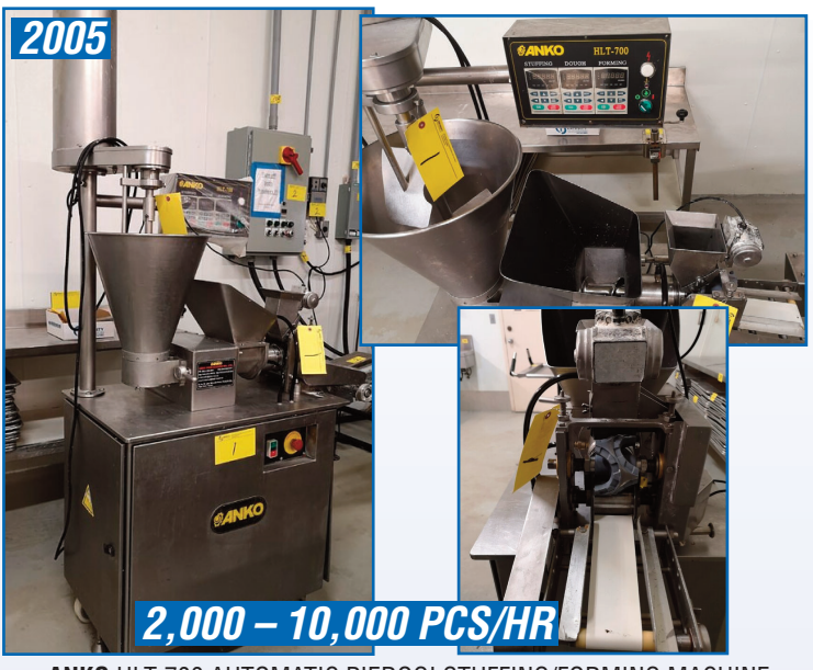
ANKO HLT-700 AUTOMATIC PIEROGI STUFFING/FORMING MACHINE W/ PIEROGI DIES, S/N 0506677, 220V, 60 HZ, 2,300W