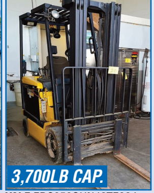
YALE ERC050GHN48TE084 ELECTRIC FORKLIFT, 36V