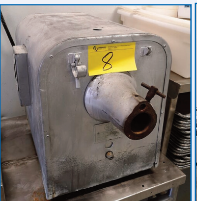
HOBART 4542 HEAVY DUTY HIGH CAPACITY MEAT GRINDER